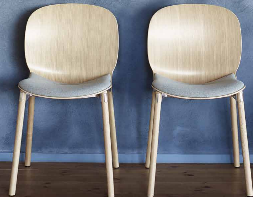
Cover: RBM Noor 6085 S, fabric: Main Line Flax 024 Fabrics and colours – Trend 2016 | 01