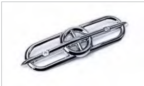
OIL TANK EMBELLISHER ✂ 0.1 Chrome plated Oil Tank Embellisher replaces original equipment part. A9738001