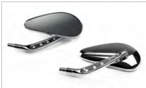
TEARDROP MIRRORS - DRILLED STEM ✂ 0.2 High gloss chrome mirror kit, featuring laser etched Triumph logo. A9638034