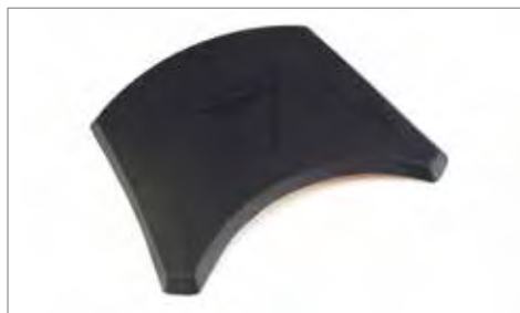
TANK PAD ✂ 0.1 Self adhesive rubber Tank Pad with embossed Triumph logo. A9718006