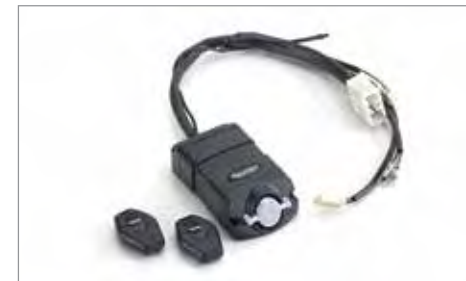
ALARM IMMOBILISER ✂ 1.0 Alarm immobiliser system developed in conjunction with Datatool. Cat 1 Thatcham approved. A9808066