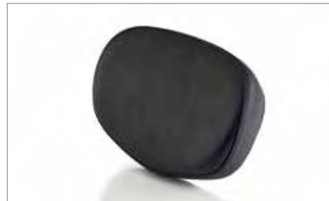
SISSY BAR BACK REST - CLASSIC ✂ 0.2 To be used with the Quick Release Sissy Bar kit. A9708177