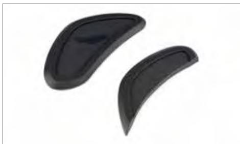
KNEE PADS ✂ 0.2 Protects the sides of the fuel tank from everyday knocks and scratches. Self adhesive. A9718005