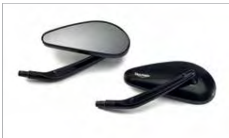
TEARDROP MIRRORS - BLACK ✂ 0.2 Tapered Teardrop Style. Satin Black finish. Fits all Triumph Cruisers. A9638085