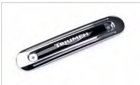
OIL TANK EMBELLISHER - TRIUMPH ✂ 0.1 Chrome plated Oil Tank Embellisher replaces original equipment part. A9738140