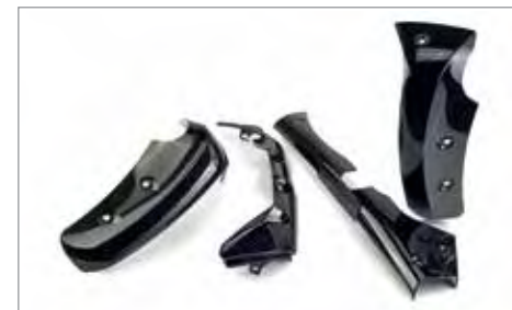
RADIATOR END CAPS - PAINTED ✂ 0.4 Painted alternative to the chrome end caps which are standard on the Rocket III. A9748026-##