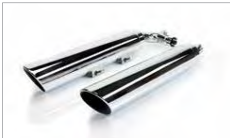
ACCESSORY SILENCERS* ✂ 0.7 Supplied with dedicated engine tune to guarantee optimum performance. Off road use only. A9608077