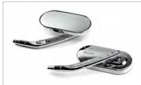
OVAL MIRRORS - DRILLED STEM ✂ 0.2 High gloss chrome mirror kit, featuring laser etched Triumph logo. A9638032