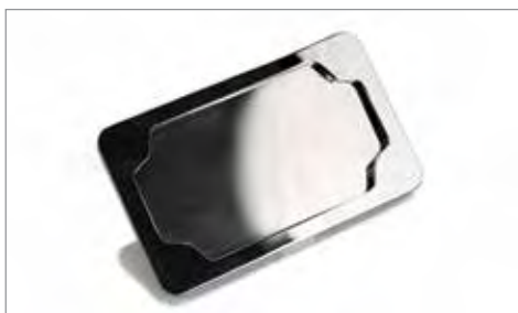
LICENSE PLATE FRAME - CHROME ✂ 0.2 Designed for use with registration plates, 7.25 x 4.25". A9730221