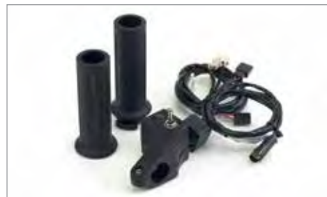
HEATED GRIP KIT ✂ 1.3 Internally wired heated grip kit and switch mount. A9638053