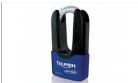
TRIUMPH DISC LOCK ✂ 0.0 High quality, forged disc lock and nylon branded carry pouch. ART****, Sold Secure Gold & SRA approved. A9810000