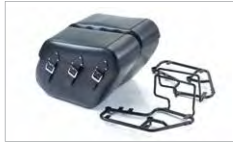
LEATHER PANNIERS ✂ 0.7 Manufactured from 4 mm aniline leather, complete with mounting rails. Capacity 28 litres per bag. A9528014