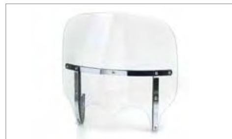
ROADSTER SCREEN ✂ 0.3 Requires front end fixing kit, A9738051. A9748036