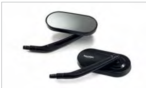
OVAL MIRRORS - BLACK ✂ 0.2 Satin Black finish. Fits all Triumph Cruisers. A9638084