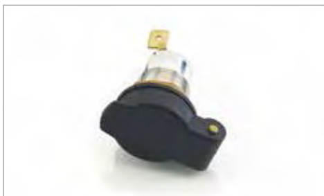
AUXILIARY POWER SOCKET ✂ 0.1 Auxiliary Power Socket for use with Optimate Adaptor, A9930011. A9938047