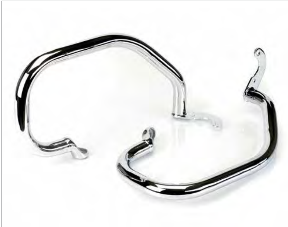
FRONT ENGINE DRESSER BARS ✂ 0.5 Can be installed with Highway Peg Mount kit, A9750455 (Adjustable) or A9750463 (Fixed Position). A9758099