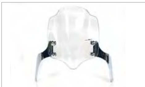
SPORT SCREEN ✂ 0.5 Requires front end fixing kit, A9738051. A9748048