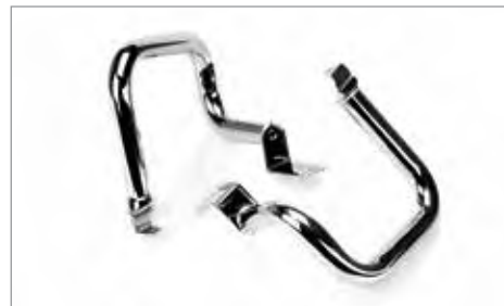
REAR DRESSER BARS - CHROME ✂ 0.5 Supplied complete with all mounting hardware. A9758047