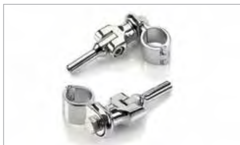
FIXED HIGHWAY PEG MOUNTS ✂ 0.2 Can only be used in conjunction with A9750459 (Logo) & A9750523 (Chromeline). A9750463