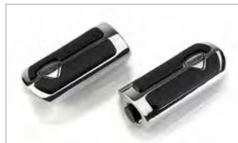
HIGHWAY PEGS - LOGO BADGE ✂ 0.2 Features rubber foot grip and Triumph logo. For use with either A9750455 or A9750463 Mounting Kits. A9750459