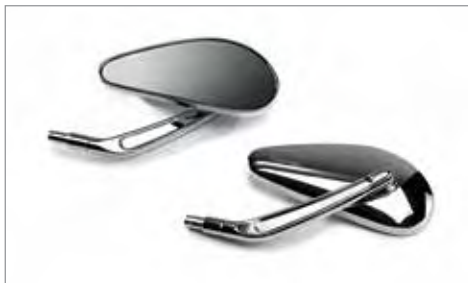
TEARDROP MIRRORS - SOLID STEM ✂ 0.2 High gloss chrome mirror kit, featuring laser etched Triumph logo. A9638033