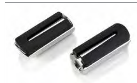
"CHROME LINE" HIGHWAY PEGS ✂ 0.2 Features rubber foot grip and Triumph logo. For use with either A9750455 or A9750463 Mounting Kits. A9750523