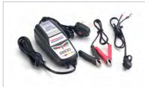
TRIUMPH BATTERY OPTIMISER ✂ 0.0 Fully Automatic Battery Charger for lead acid batteries. A9930218 (UK) A9930219 (EU)