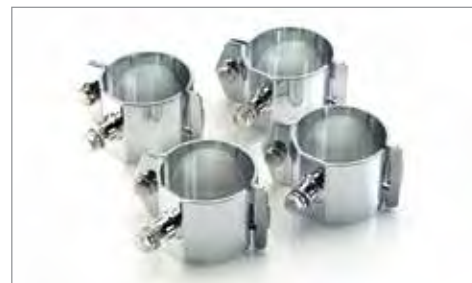
FRONT END FIXING KIT ✂ 0.3 Required to install Rocket Screens/Fog Light Kits. A9738051