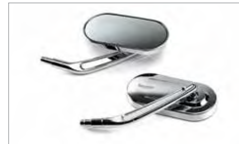
OVAL MIRRORS - SOLID STEM ✂ 0.2 High gloss chrome mirror kit, featuring laser etched Triumph logo. A9638031