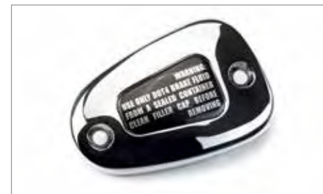
MASTER CYLINDER COVER - CHROME ✂ 0.1 High gloss chrome alternative to standard equipment. A9738061