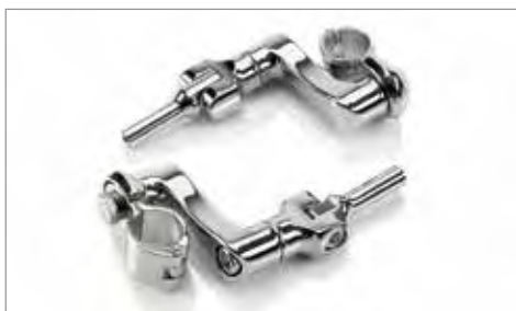
ADJUSTABLE HIGHWAY PEG MOUNTS ✂ 0.3 Can only be used in conjunction with A9750459 (Logo) & A9750523 (Chromeline). A9750455