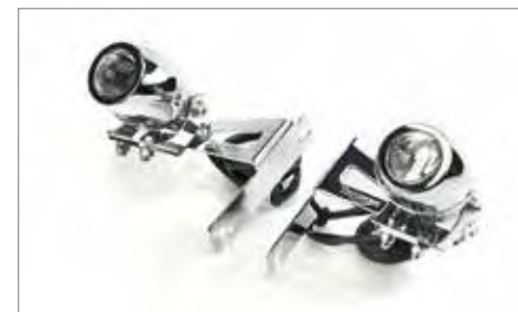
FOG LIGHT KIT ✂ 0.9 Streamlined auxiliary lamps offering functionality and style. Requires Front End Fixing Kit, A9738051. A9938142