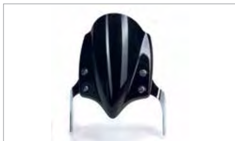
FLY SCREEN - PAINTED ✂ 0.5 Requires front end fixing kit, A9738051. A9748045-##