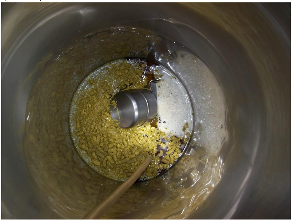
THE KEG IS BEING FILLED STRAIGHT FROM THE FERMENTER THROUGH THE "OUT" PORT. USE THE KEG AS THE SECONDARY FERMENTER, THERE ARE SO MANY ADVANTAGES TOO NUMEROUS TO LIST HERE. YOU CAN RACK STRAIGHT INTO TO THE KEG VIA OTHER MEANS IF DESIRED. (NEXT PAGE)