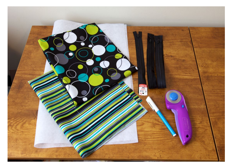
Materials: 2 fat Quarters 1 piece of interfacing measuring 18" X 22" 3- 9" multipurpose zippers (plastic teeth) invisible ink marker