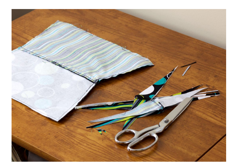
Cut 1/4" away from your sewn congruent trapezoids.