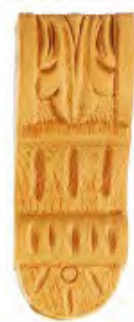
KA592 Height 133 Width 53 Thickness 41