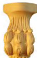
FU5/A Height 115 Width 75 Thickness 50