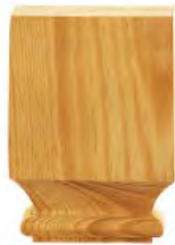
KA626 Height 100 Width 75 Thickness 30