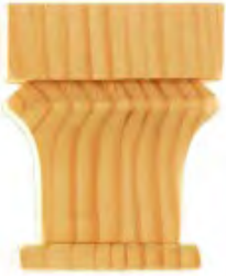
KA614 Height 75 Width 55 Thickness 25

Detailed pictures (DIN A4) of each item can be downloaded from our website www.candidus-prugger.com , by inserting the product code in the search box on the upper right-hand side of the page and clicking the picture subsequently shown.