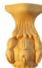
FU5 Height 170 Width 120 Thickness 75