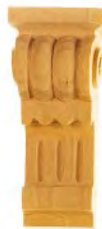
KA615 Height 145 Width 70 Thickness 45