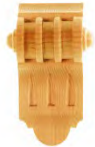
KA612 Height 120 Width 55 Thickness 45