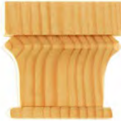
KA613 Height 75 Width 76 Thickness 35