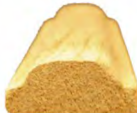
P-265 Height 8 Width 19 Length 1500 - 3100