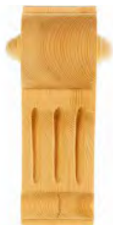
KA617 Height 160 Width 80 Thickness 65