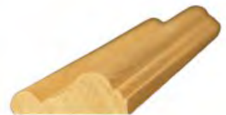
PR-1 Height 8 Width 18 Length 1500 - 3100