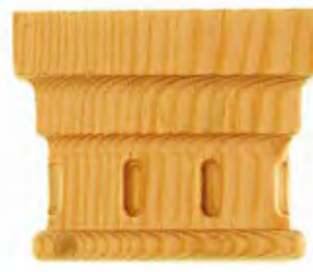
KA619 Height 58 Width 72 Thickness 19