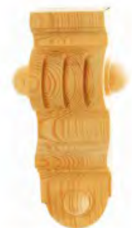
KA611 Height 145 Width 50 Thickness 35