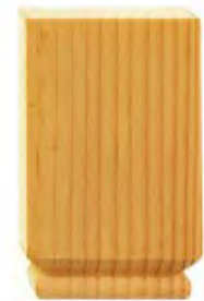
KA627 Height 100 Width 65 Thickness 25