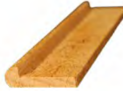
P-5 Height 5 Width 16 Length 1500 - 3100