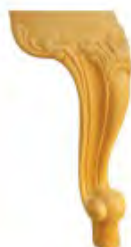
FU7 Height 255 Width 150 Thickness 95