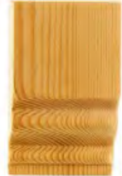
KA623 Height 82 Width 55 Thickness 27