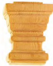
KA616 Height 102 Width 82 Thickness 35