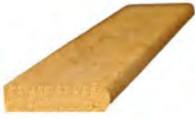
P-3 Height 5 Width 15 Length 1500 - 3100

Detailed pictures (DIN A4) of each item can be downloaded from our website www.candidus-prugger.com , by inserting the product code in the search box on the upper right-hand side of the page and clicking the picture subsequently shown.