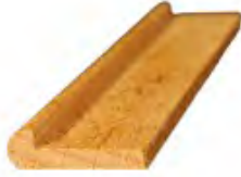
P-7 Height 5 Width 13 Length 1500 - 3100