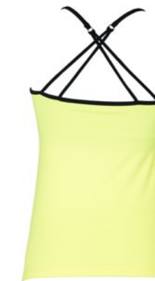
SPAGHETTI DOG Ladies Built In Bra Top Black