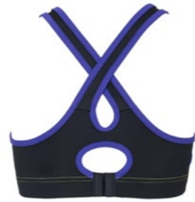
KNOCK OUT Ladies Clips Closure Bra Multicolor