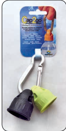
#0502 Complet Set (Two Caps)