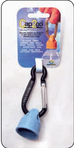
#0506 Basic Set (One Cap)